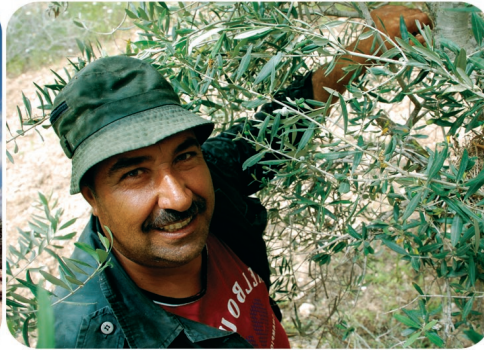
Canaan Fair Trade is certified by IMO's Fair for Life and FLO/TransFair USA