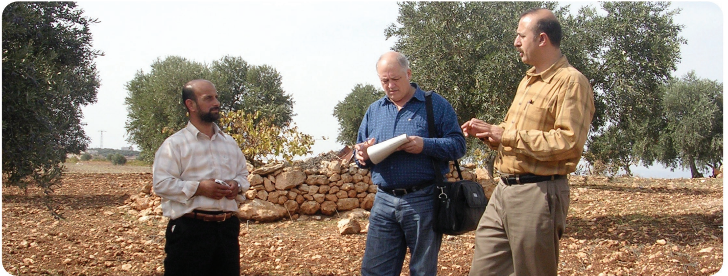
Organic and fair trade inspection at an olive orchard in Palestine

and vegetable oils, as well as downstream consumer products and companies.