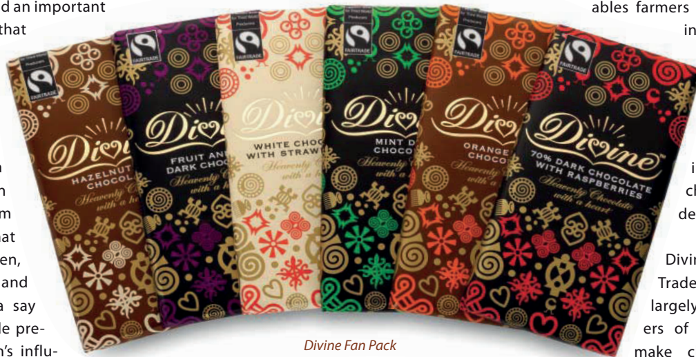
Divine Fan Pack